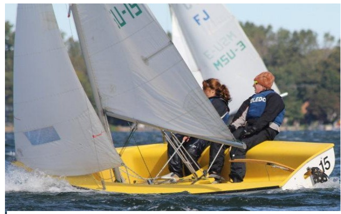
(College Sailing 2012 - University of Toledo)

Now I try to improve my skills by attending class-based racing clinics. These are often held prior to major regattas and offer coaching and "chalk talks" from a variety of