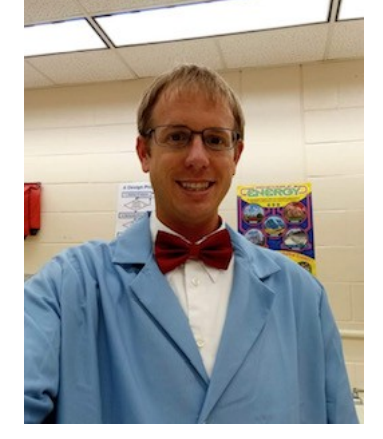
LMSA: Where do you see yourself sailing in the next 5 years?