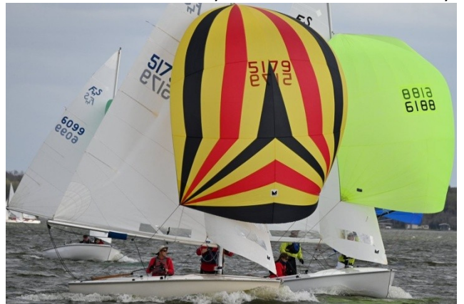
Flying Scot Racing - George Washington Birthday Regatta 2020

LMSA: Who are some of your mentors and how did you come to sail at LMSA?